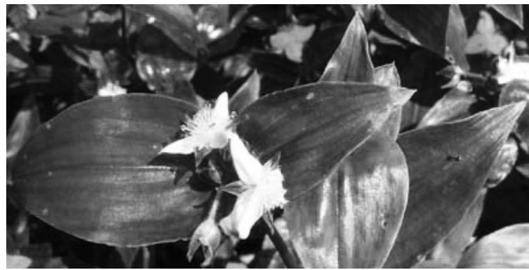
Tradescantia fluminesis ( www.friendsoflanecovenationalpark.org.au/GardenEscapes/Garden_Escapes.htm )

Most of us know the invasive weed 'wandering Jew' (these days it is referred to as Trad which reflects its botanic name Tradescantia fluminesis ). This prolific groundcover has the qualities of a succulent and can regrow from the smallest stem given the right conditions. It can cause hayfever or itchiness and has allopathic qualities that weaken nearby plants until it is the dominant ground cover.