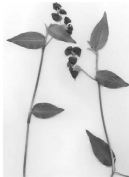
Commelina cyanea ( www.hornsby.nsw.gov.au/library/elibrary/hornsby-online-herbarium )

You can tell the difference between Trad and its native 'look-alike' Commelina cyanea by looking at the leaf. The Commelina leaf arises from an enclosed sheath which is not found in Trad. Commelina has iridescent cyan or blue flowers which are seen from spring to summer. Trad on the other hand has white flowers.