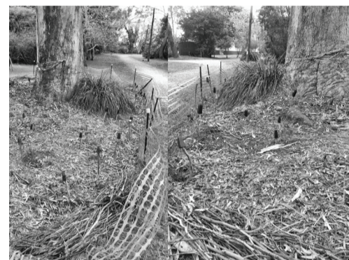
Grantham Cres, looking North (left), and south (right) at new seedlings and brush edging.