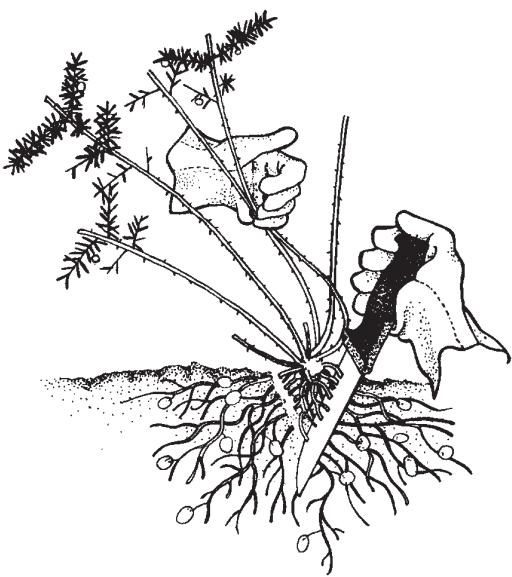
Illustration: V. Bear from HSC website

Get to know others who are interested in the natural environment that surrounds us and learn about the plants of the Reserve at the top of the Island by spending a pleasant few hours on the second Saturday of each month with the Bushcare Group. Meet at 9:00am “149” Riverview Ave – main access track into the reserve. Wear closed shoes, long sleeves and hat. No prior knowledge necessary. Next session 13th August.