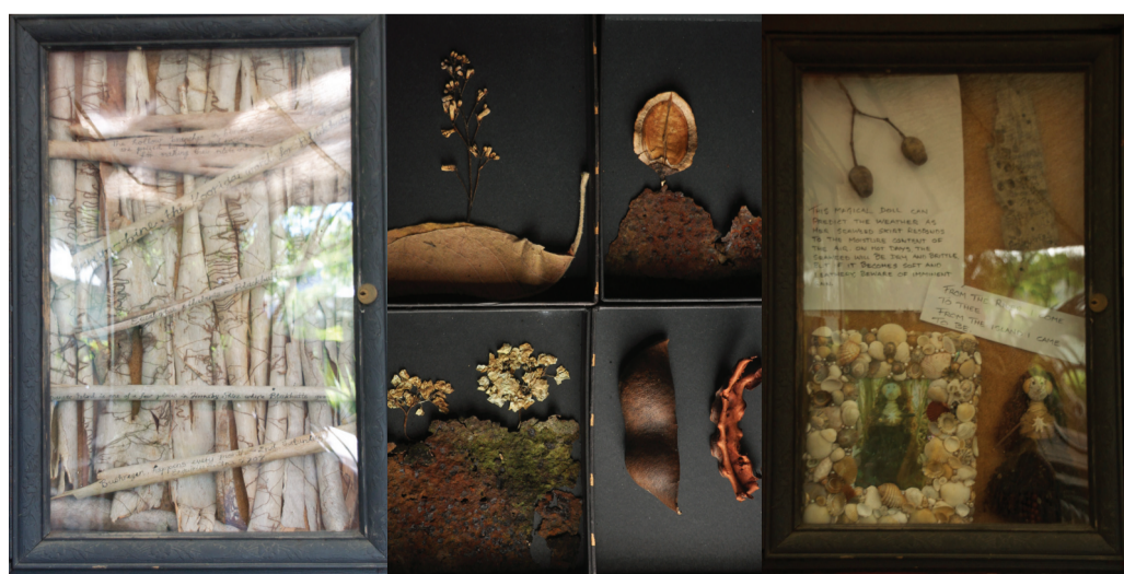
displays by Ana Pollack, Skye Goold and Fay Wolfe

We have gloves and tools for everyone. More info contact Cybele -7142