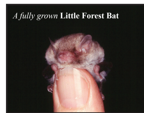
A fully grown Little Forest Bat

As I am sure many people are aware, microbats can readily be