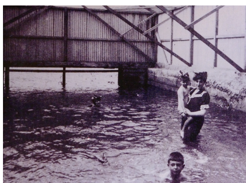
Dangar House enclosed ladies’ swimming baths, 1911